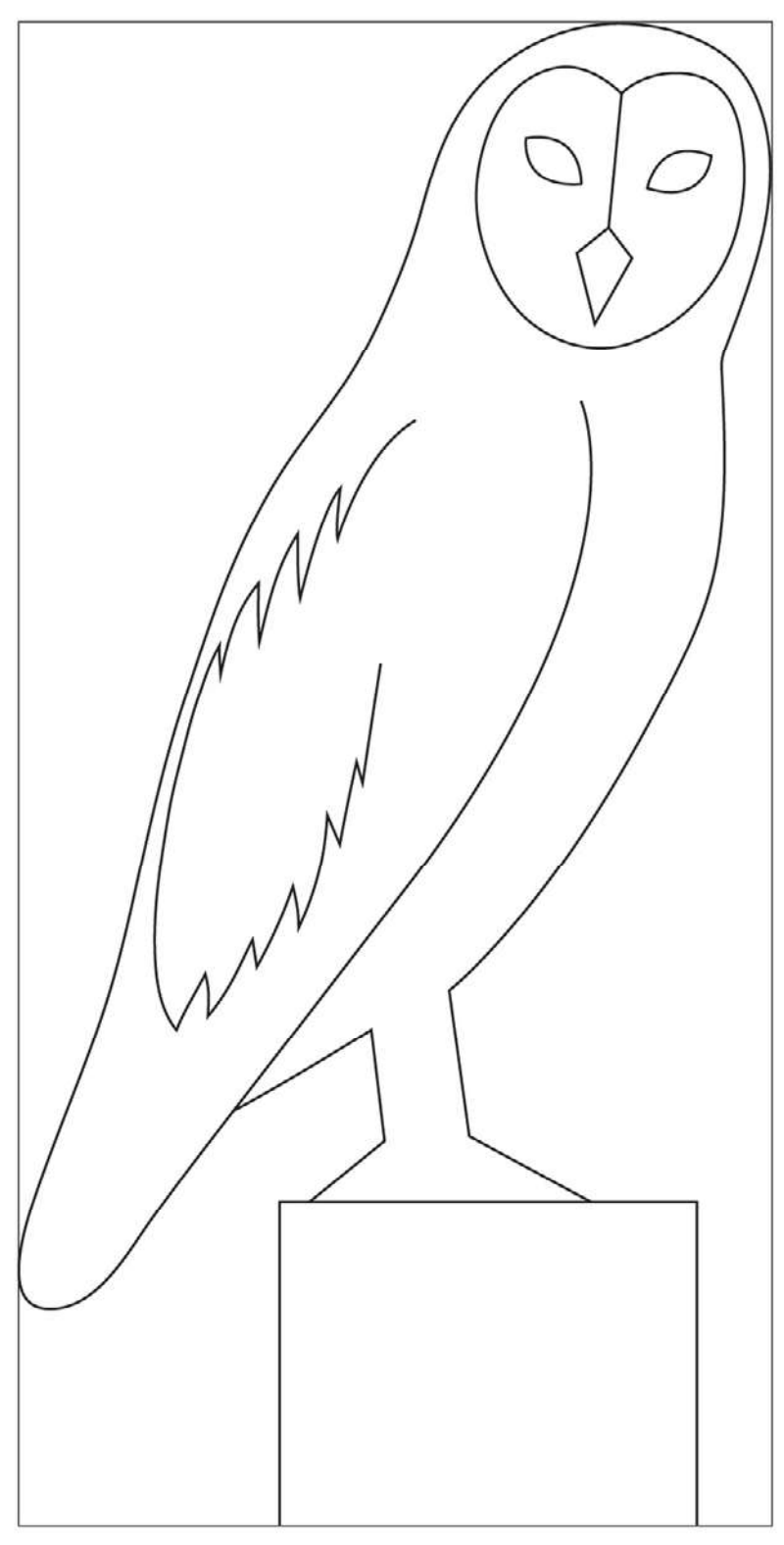
4 x 8 in.